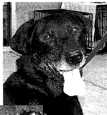
▲ Clyde ◀ Tucker

Another dog in need of a home is Clyde , an older black lab. He is very friendly and loving. Clyde can't be taken on long walks, but