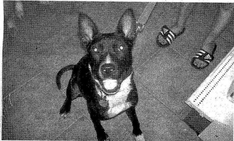
Zia from Second Chance

Oak Ridge-based rescue for dogs. One of these dogs is Ziggy, an adorable 3-year-old Cairn/Norwich terrier mix who was rescued from death row at a local pound. He is housebroken, calm, and well-mannered. Ziggy is looking for a calmer adult home where he can be the only pet. He will be a loyal, protective companion to his new owner.